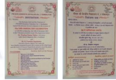
58th Annual Day Celebration